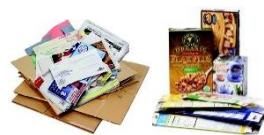
PAPER Cereal Boxes, Paper, Newspapers, Magazines, and Cardboard (all colors and types)