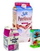
CARTONS (clean, empty, and dry)