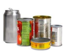
CANS Aluminum and Steel cans (clean, empty, and dry)

Please put ONLY the below materials into the curbside recycling container. Keep them clean, empty, dry, and loose. All recyclables can be mixed together and placed into the cart with the GREEN lid.