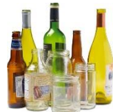
GLASS BOTTLES AND JARS (clean, empty, and dry)