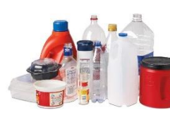
PLASTIC Plastic Bottles, Jugs, and Tubs (clean, empty, and dry)